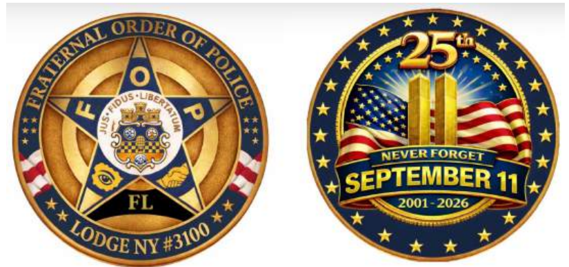
New Challenge Coin $15