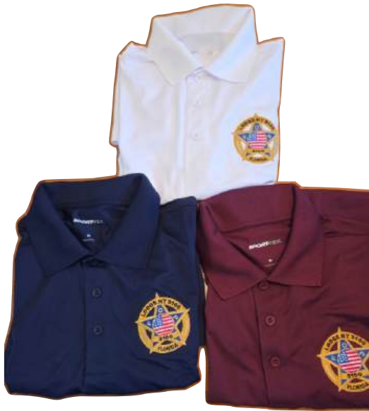
Mens Polo (M/L/XL) $25 ((2X-3X $28)