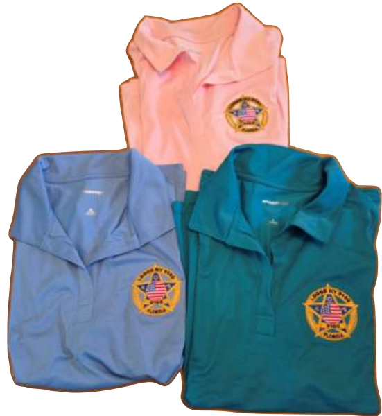
Ladies Polo's $25