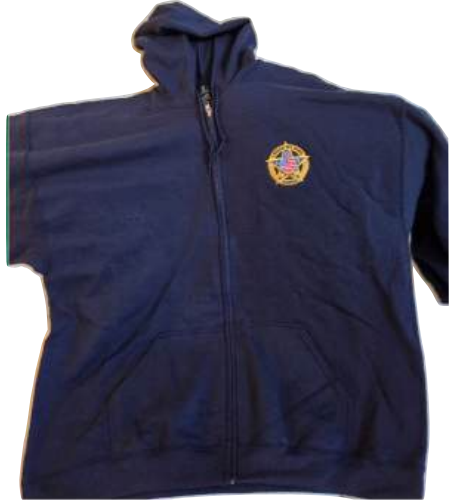
Hoodies (M,L,XL) $35 2X-3X $40